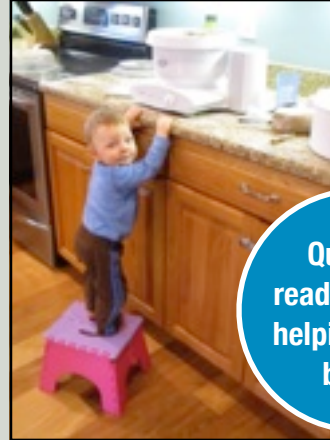
Quinn is ready to start helping make bread