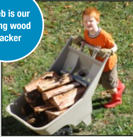
Caleb is our strong wood stacker