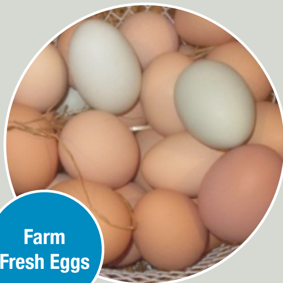
Farm Fresh Eggs

prevents contamination. And hens that are raised in a free-range environment rarely carry the salmonella bacteria. Whereas in industrial concentrated animal feeding operations (CAFOs), the risk of salmonella is quite high. CAFOs raise caged hens with as many as 30,000 to millions of hens in one building in very tight quarters. Disease is rampant and the birds are filthy in these conditions. They're also more likely to be antibiotic-resistant strains, due to the flock's routine exposure to such drugs. According to mercola.com, it is due to these disease-promoting practices that the US also employs egg washing - a technique that's actually BANNED in Europe because it may actually make the eggs more susceptible to contamination with bacteria.